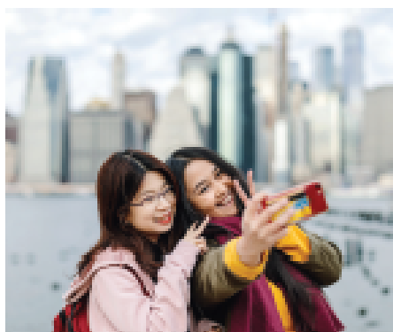
Weekend excursions and overnight trips to places outside of New York City