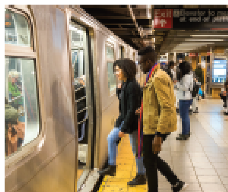
Round-trip airport transportation, MetroCards, housing, meals, and anything else to fit your group's needs!