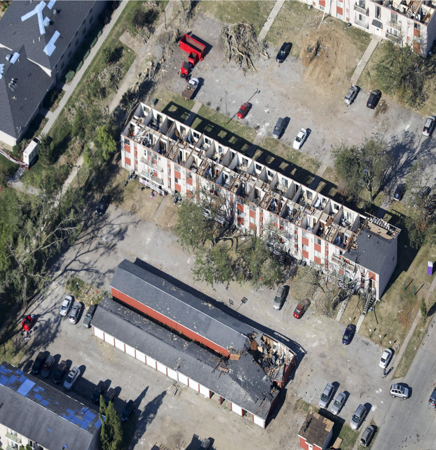
Appendix B: Aerial Image Showing Damage from the 2020 Derecho