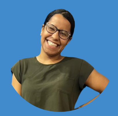
One Card Coordinator Pleasantville Campus