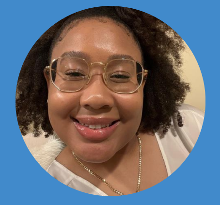
Administrative Student Operations