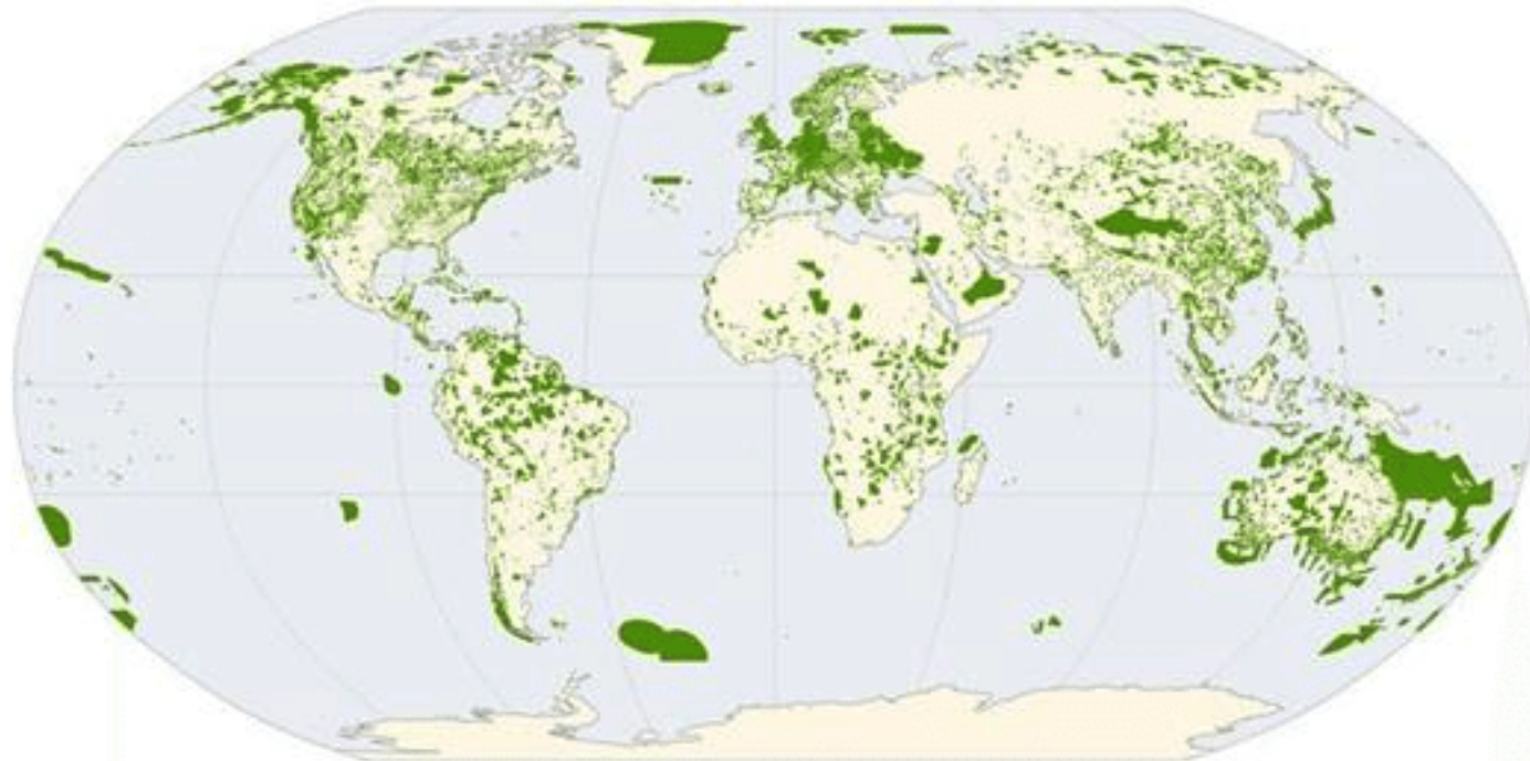
IUCN Map of Terrestrial Protected Areas (2017)

World Data Base on Protected Areas Areas (UNEP/IUCN/WCMC)