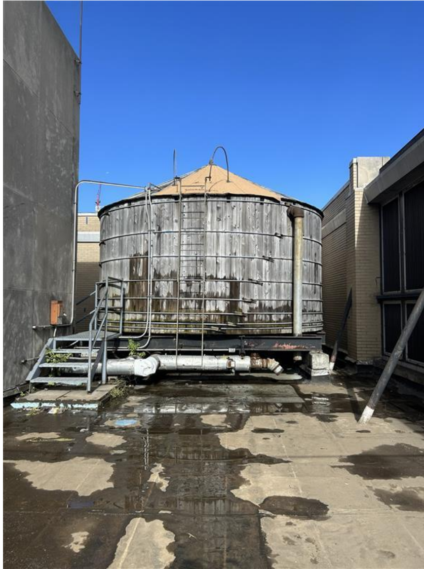
19 th Floor roof existing water tower.