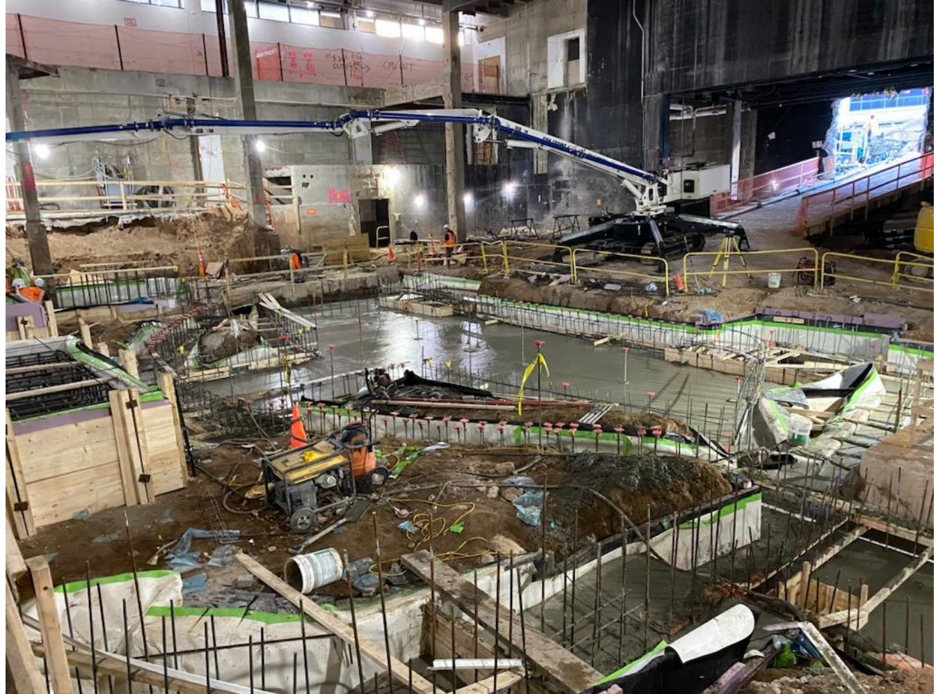
10/15 Concrete pour at Large Venue mat slab, roughly 200 cubic yards.