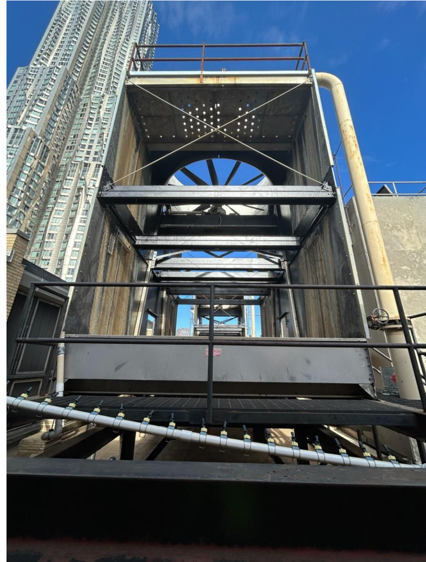
Existing rooftop mechanical equipment to be replaced.