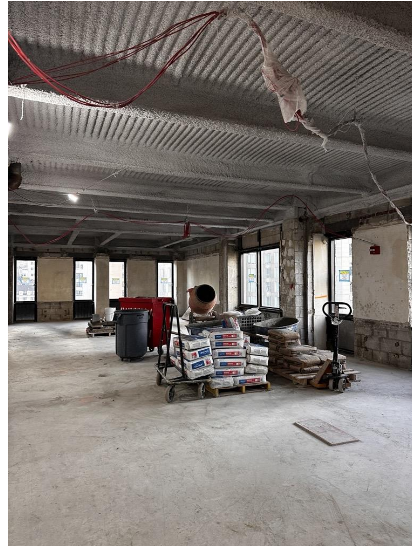
18 th Floor progress.