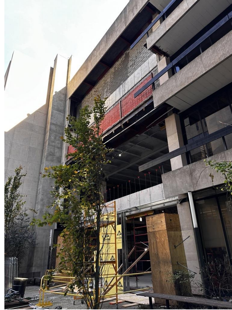
View of Small and Medium Venues from the courtyard.