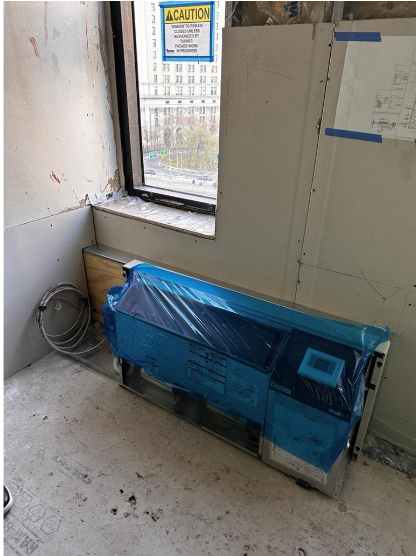
Preparation for HVAC unit installation.