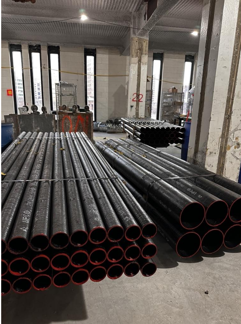
Storm piping delivered to site. Installation is upcoming during week of 12/02.