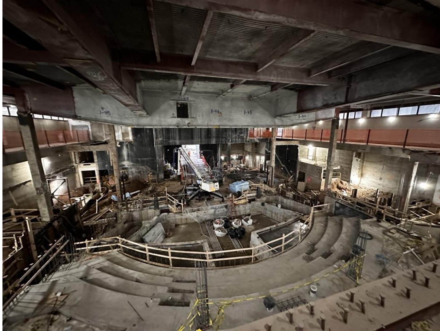
Concrete pour in balcony seating. Protections have been installed over the new stage slab in preparation for overhead structural demolition (beginning on 12/02).