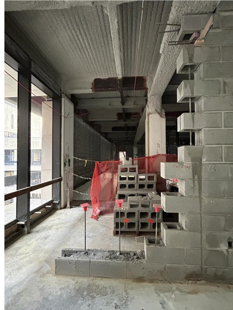
CMU block wall installation ongoing throughout.