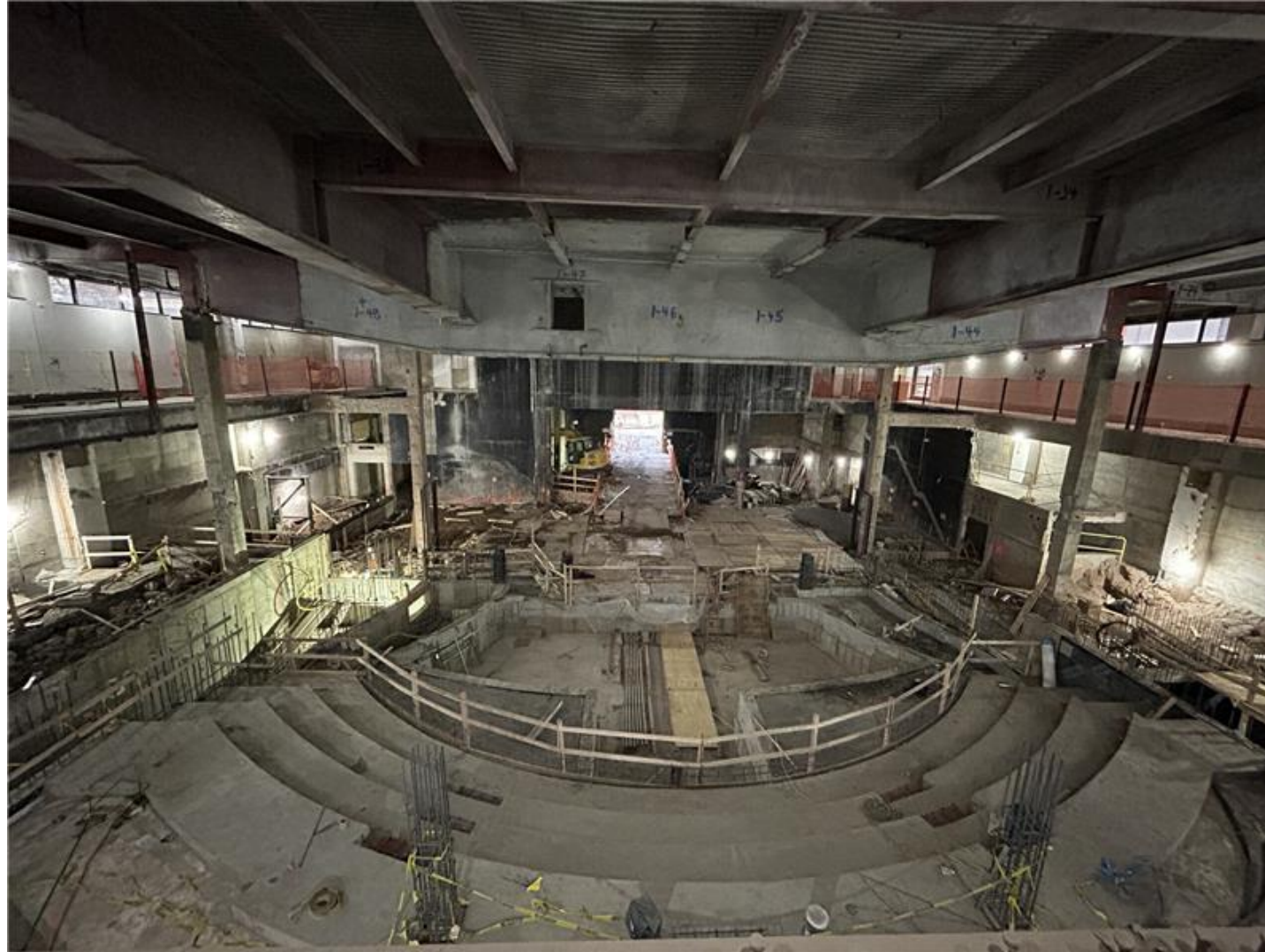
Overhead structural demolition began this week, protections are installed on the new stage slab.