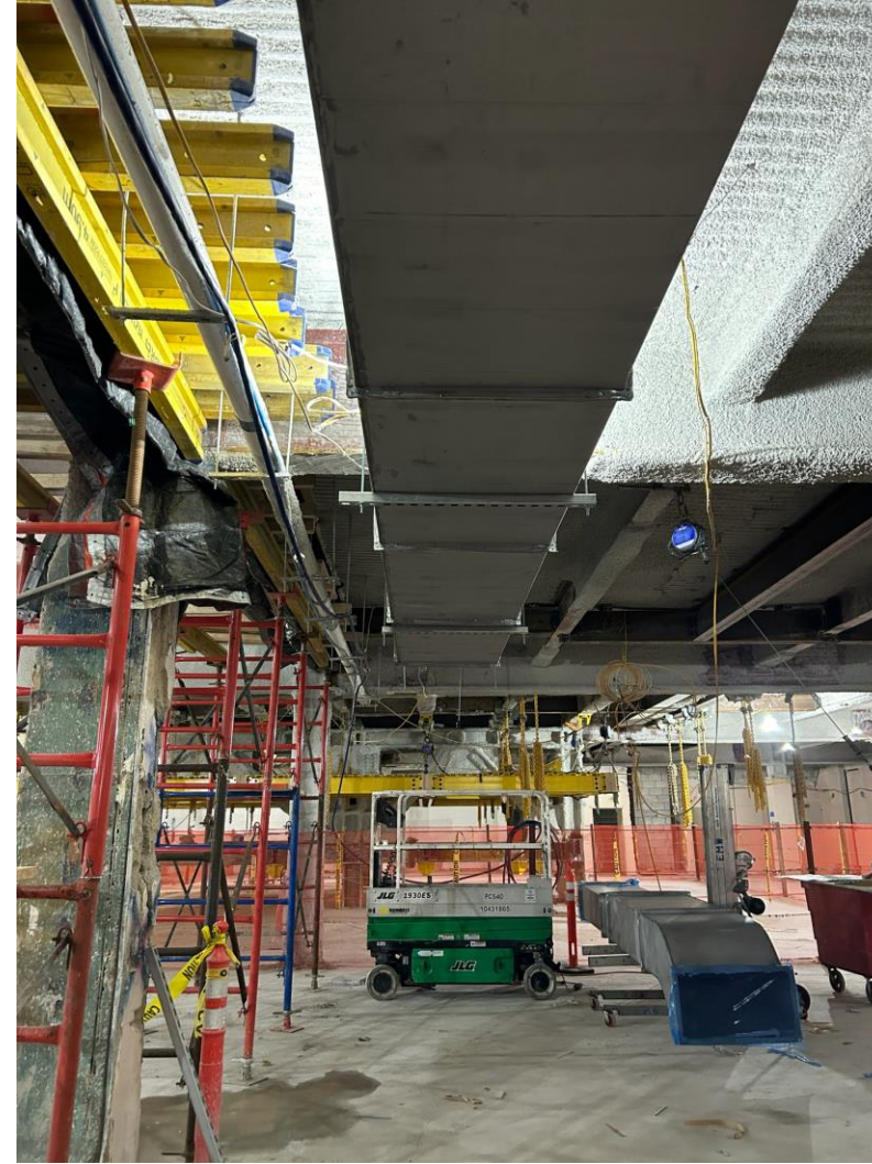
Ductwork installation has started on the 2 nd Floor.