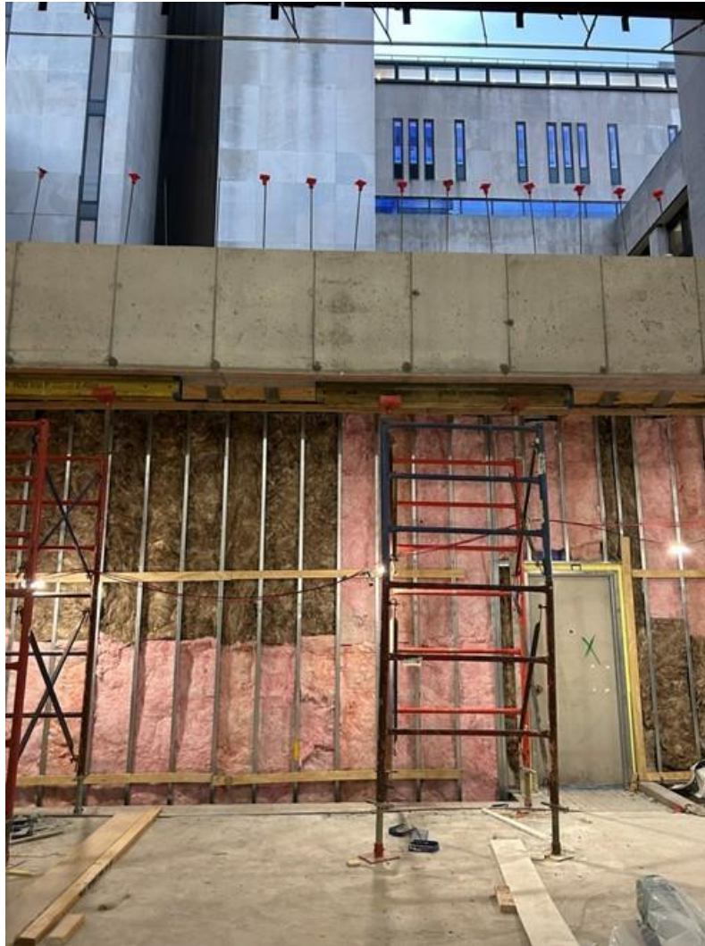
View of Small Venue weather wall from interior looking out at PPW courtyard.