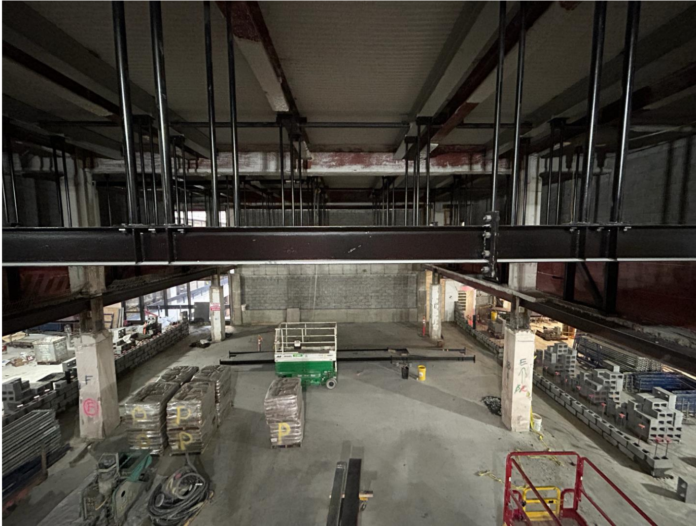
View of Medium Venue from 3 rd Floor.