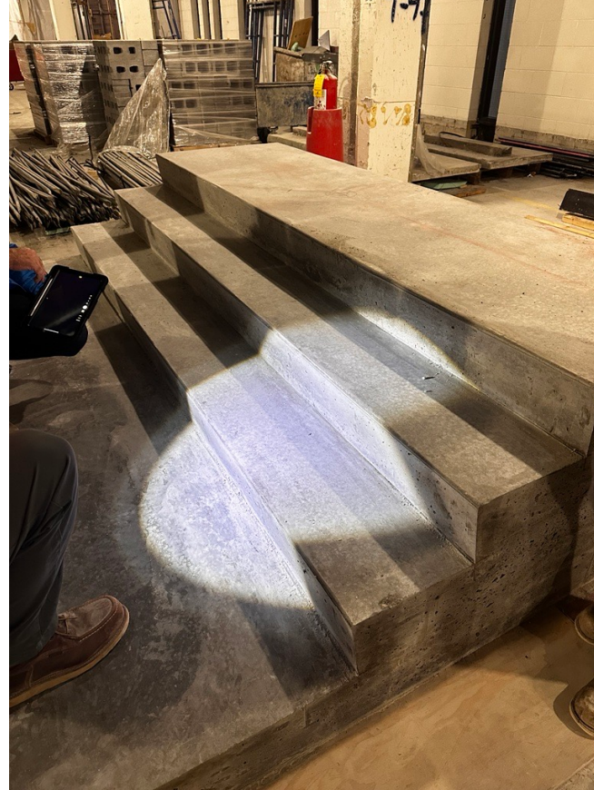
Concrete Stair Mockup in the Podium