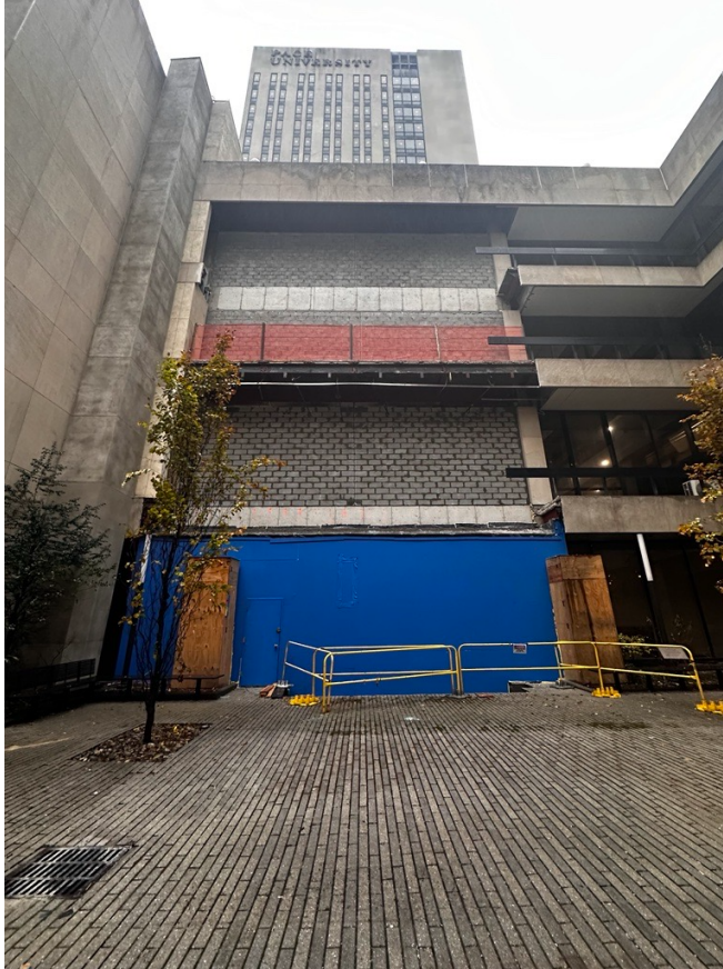
Courtyard East exterior wall enclosed, new façade wall to be installed in the future.