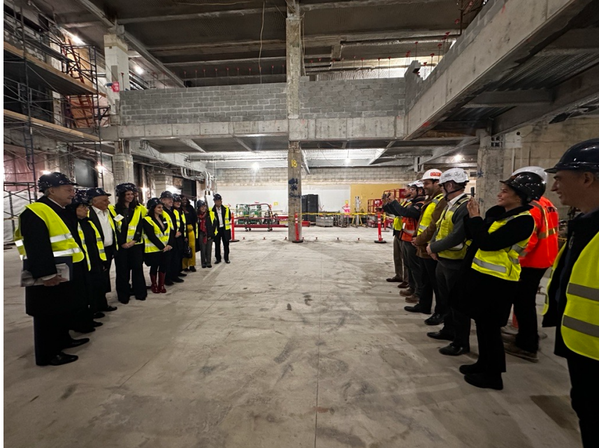
Board of Trustee Walkthrough – December 10, 2024