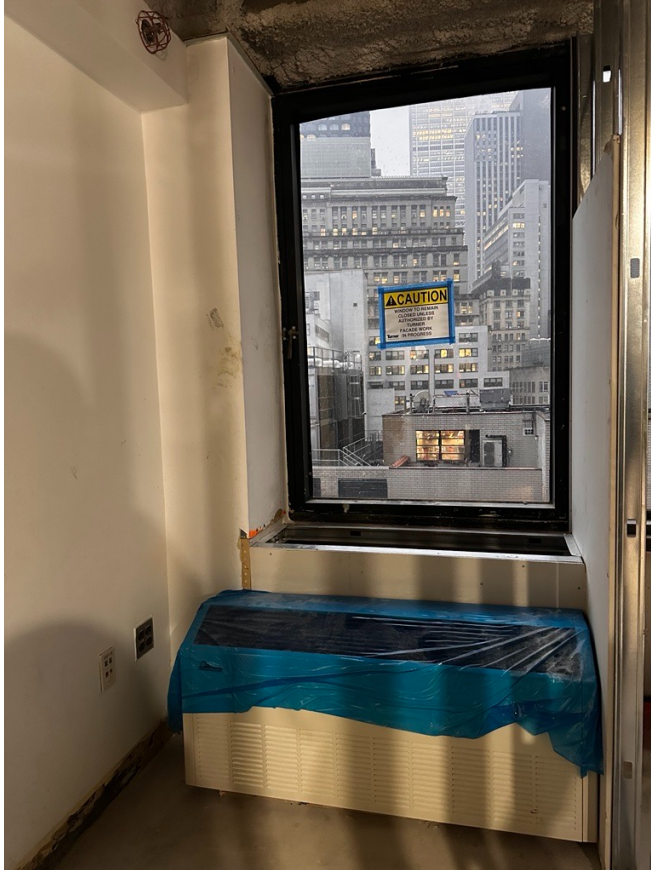
Maria's Tower Perimeter Heat Pump Unit Installation Mockup