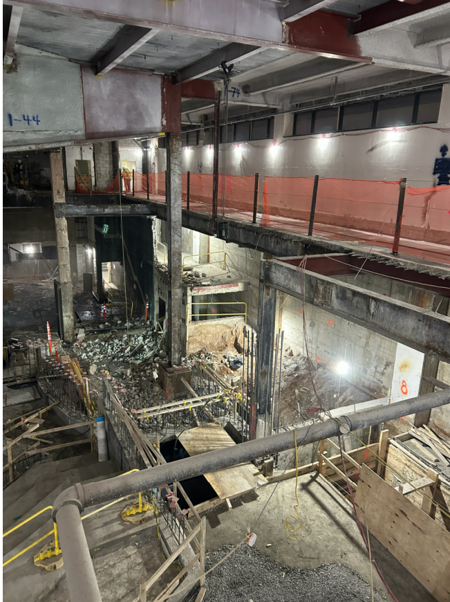
Demolition of concrete encasement on structural steel continues.