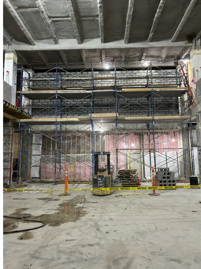
View from Small Venue interior towards the courtyard exterior wall.