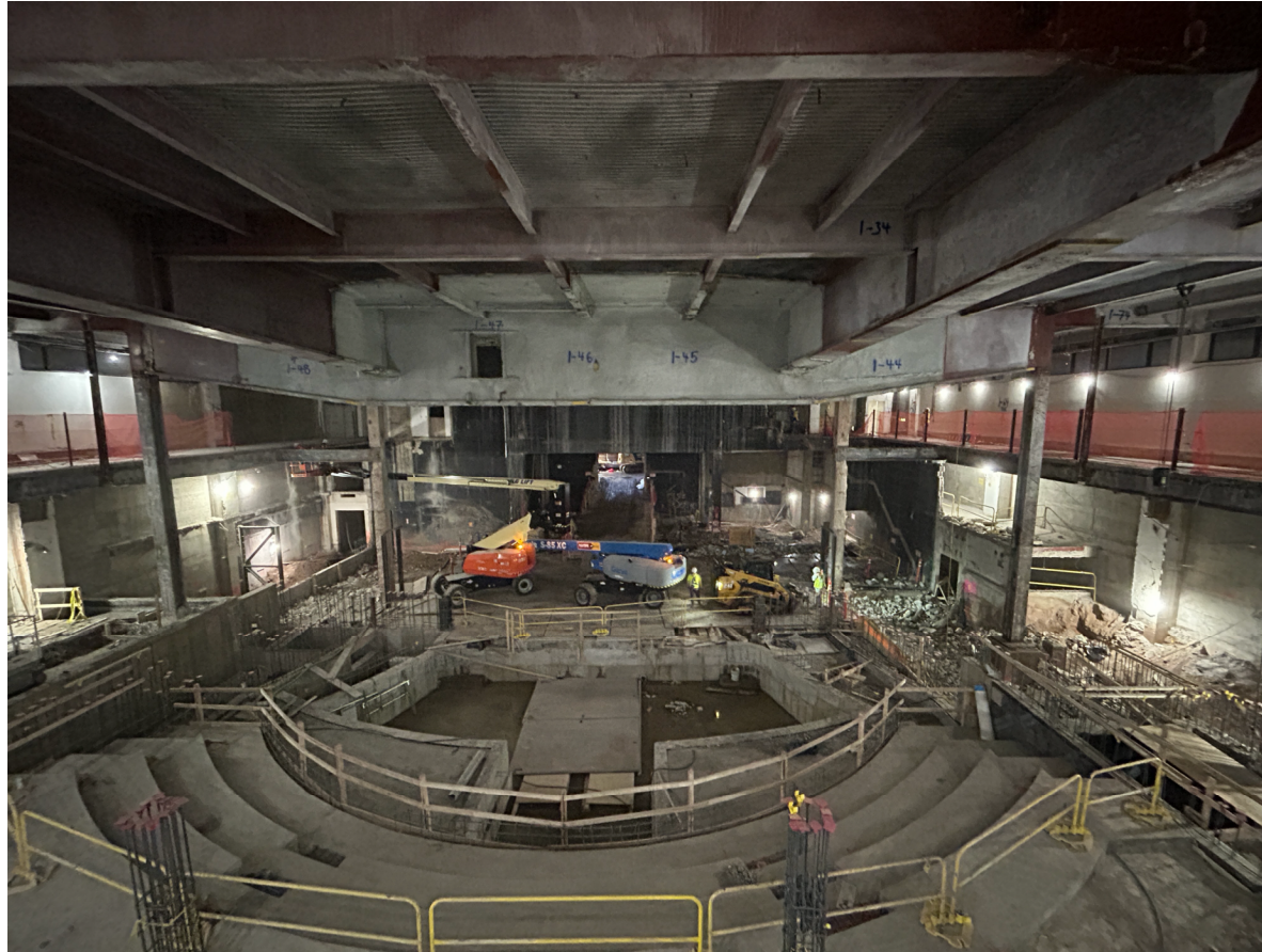
Overhead structural demolition continues as well as demolition of concrete beam encasement.