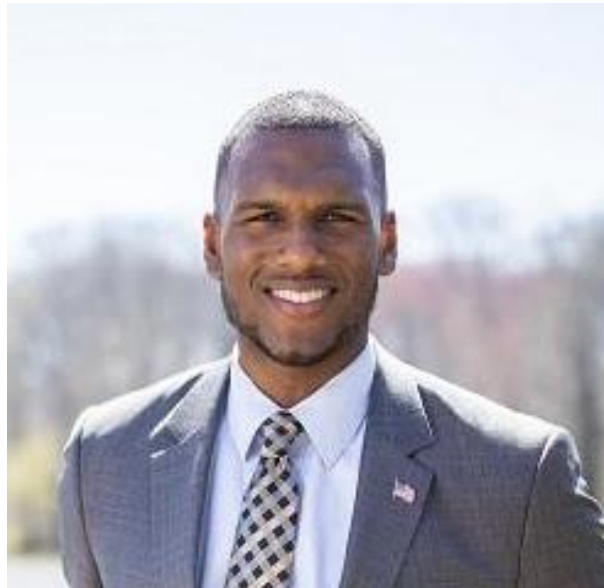
Charles Fall (Government Management track) NY Assembly Member for the New York's 61st Assembly District.