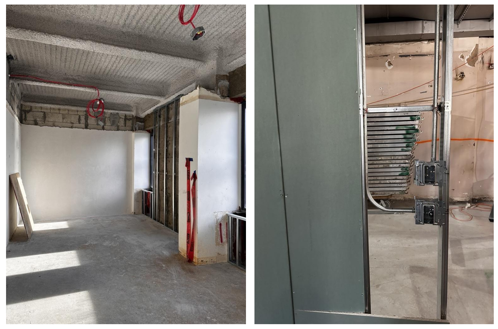
Interior carpentry work is ongoing in Maria's Tower