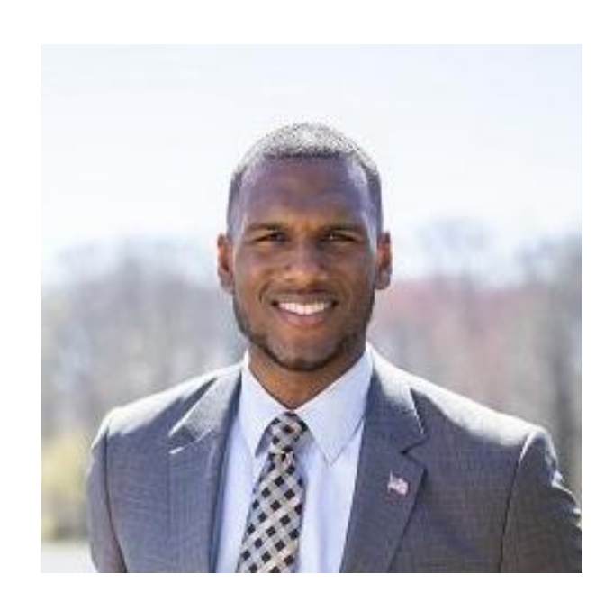
Charles Fall (Government Management track) NY Assembly Member for the New York's 61st Assembly District.