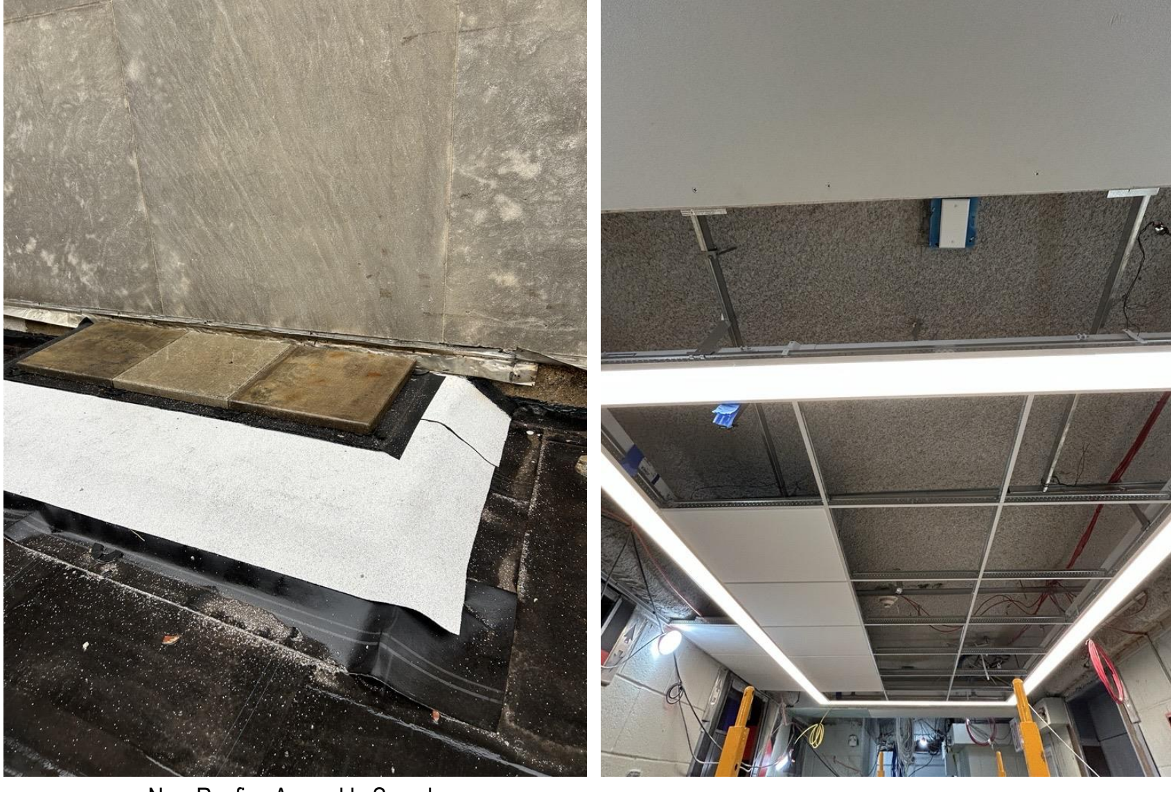
New Roofing Assembly Sample