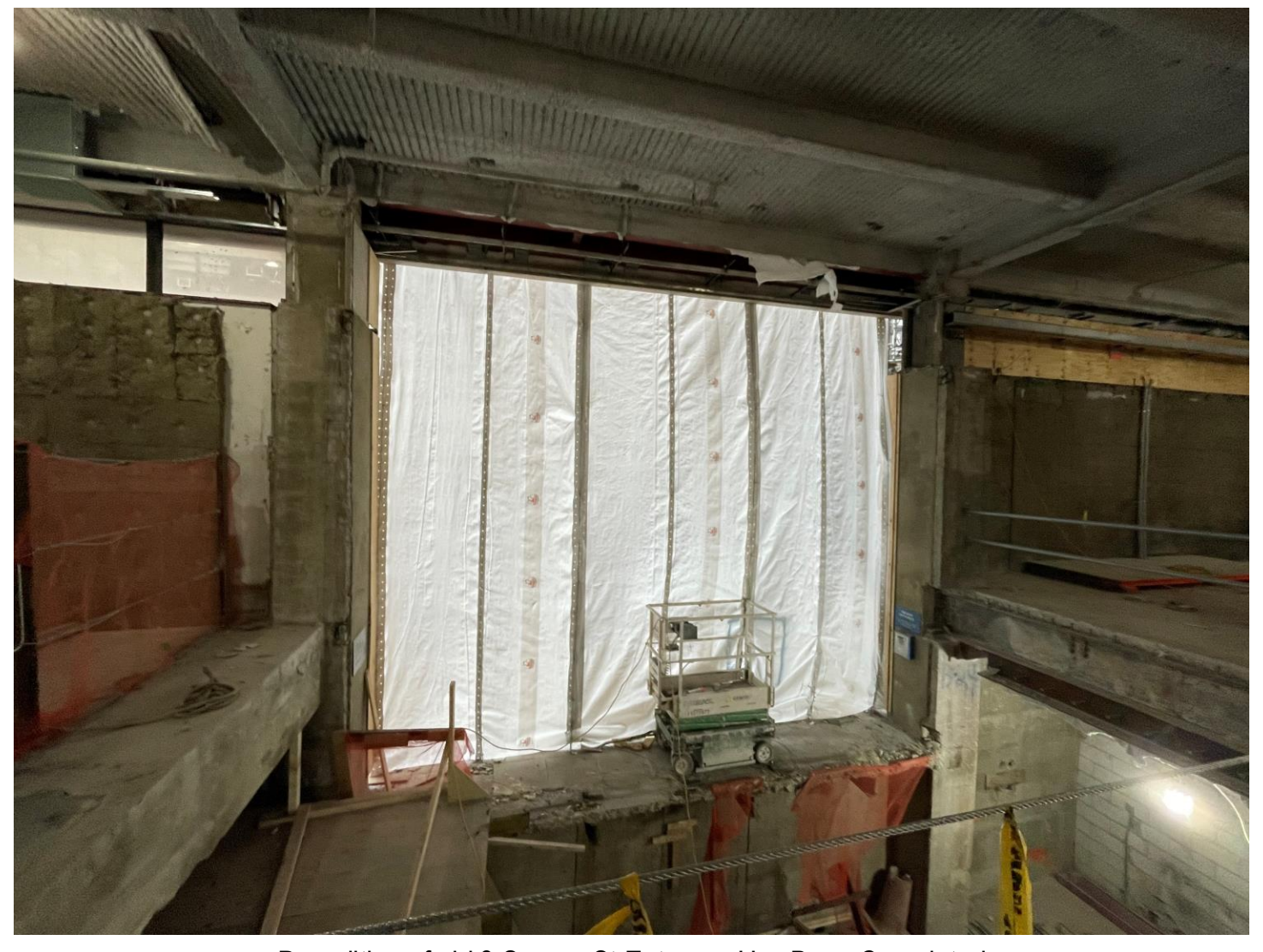
Demolition of old 3 Spruce St Entrance Has Been Completed