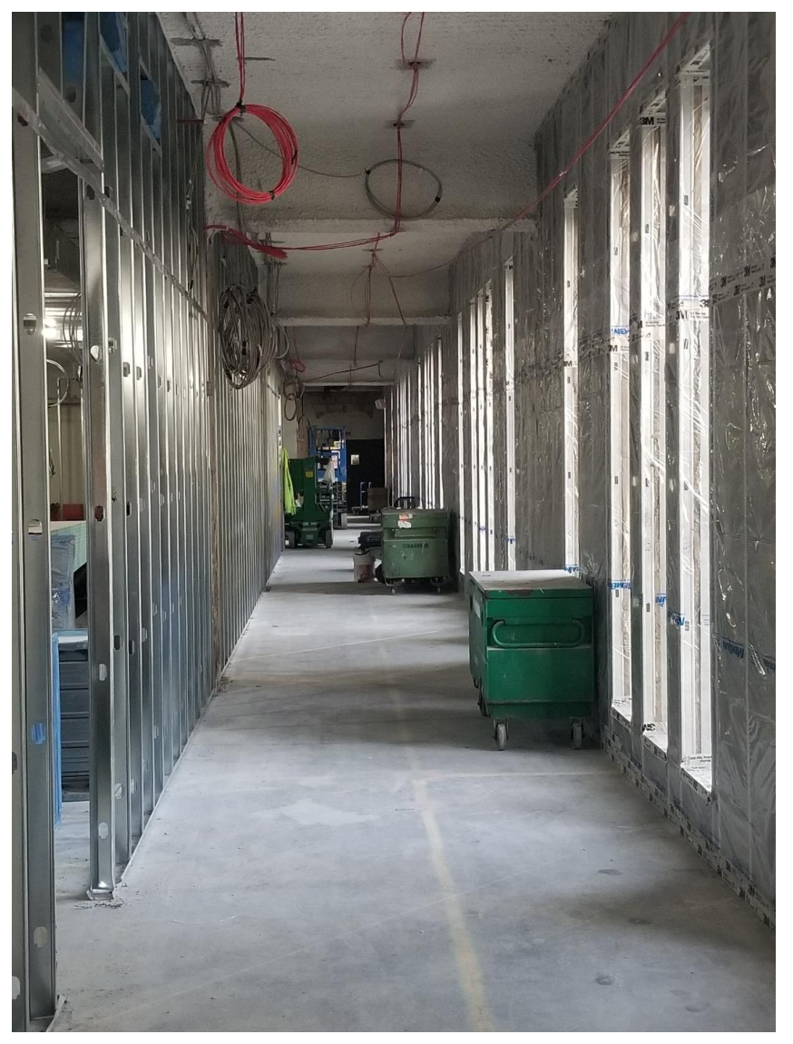
Carpentry, MEP installation ongoing throughout the Podium.